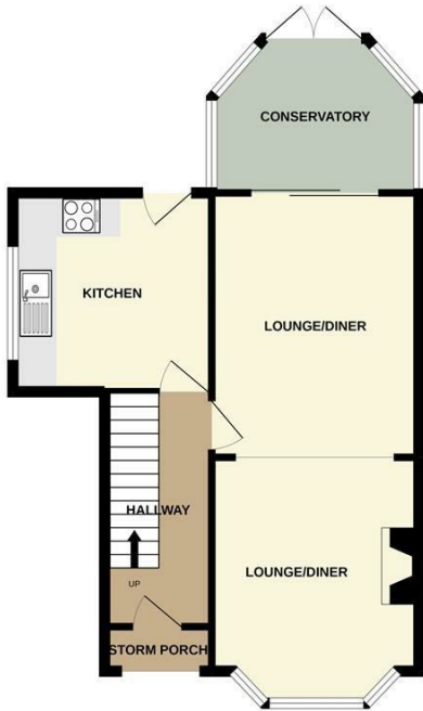
GROUND FLOOR 535 sq.ft. (49.7 sq.m.) approx.