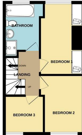
1ST FLOOR 363 sq.ft. (33.8 sq.m.) approx.